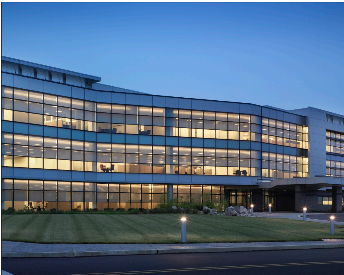
The importance of IHA - aligned shades create clean lines

IHA is the most advanced system for controlling shade movement and maintaining hembar alignment that is currently available. It is just one of the features that makes Lutron shades the most precise and most customizable shading system in the world.