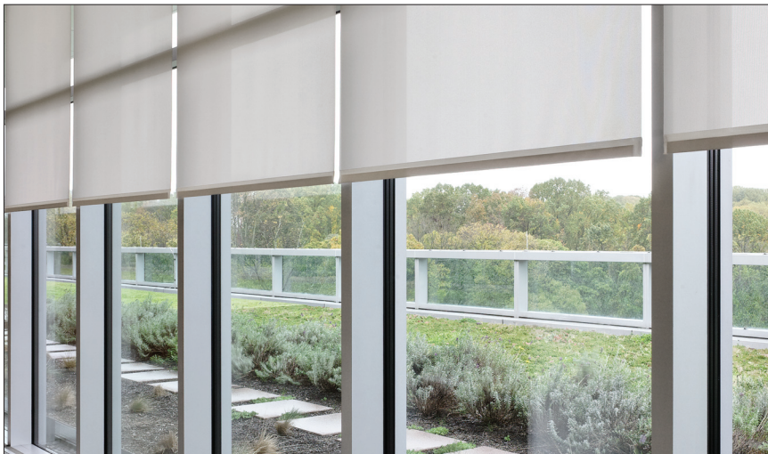
Standard IHA - keeps shades aligned

Standard IHA: All Lutron shades are pre-calibrated to run at the same drive speed before leaving the factory. In most installations shades will be aligned within 1/8”.