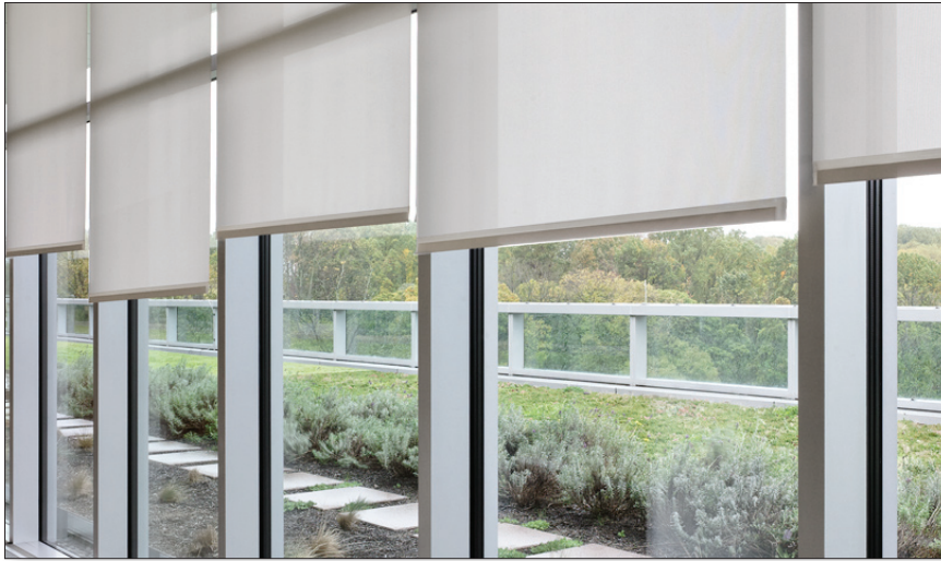
Industry standard - shades misalign over time